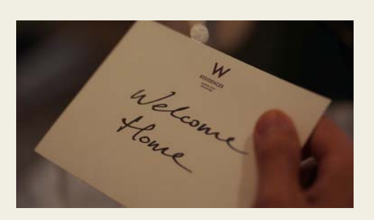
W RESIDENCES SERVICES REEL