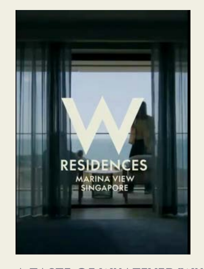
A TASTE OF WHATEVER/WHENEVER