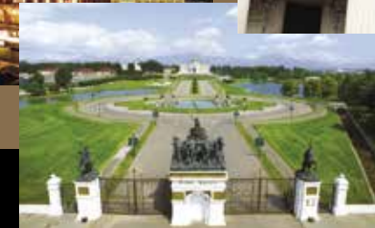
Reignwood Pine Valley, Beijing