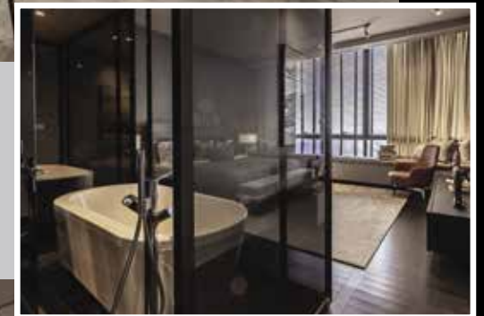
Designer fittings from international lifestyle brands