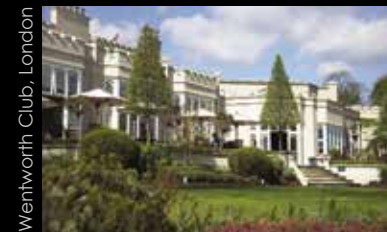
Wentworth Club, London

滚滚长江东逝水，浪花淘尽英雄。是非成败转头空，青山依旧在，几度夕阳红。白发渔樵江渚上，都付笑谈中。