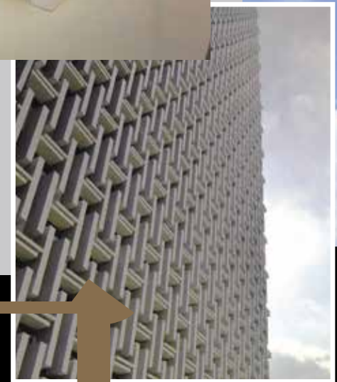
One of the world's tallest en-suite sky garage